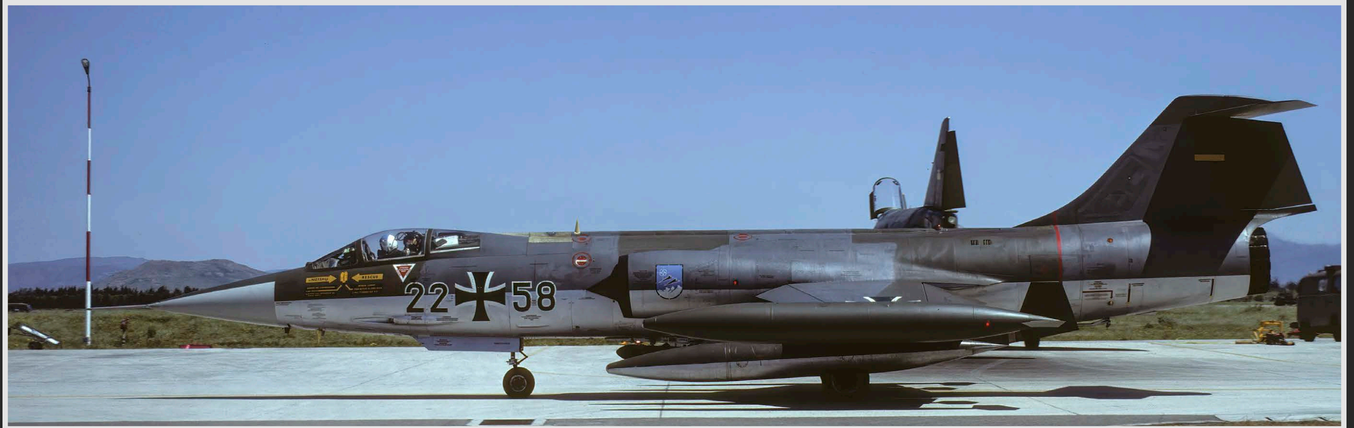
German Air Force Lockheed F-104G Starfighter assigned to Jagdbombergeschwader 34 at Memmingerberg AB, Germany.