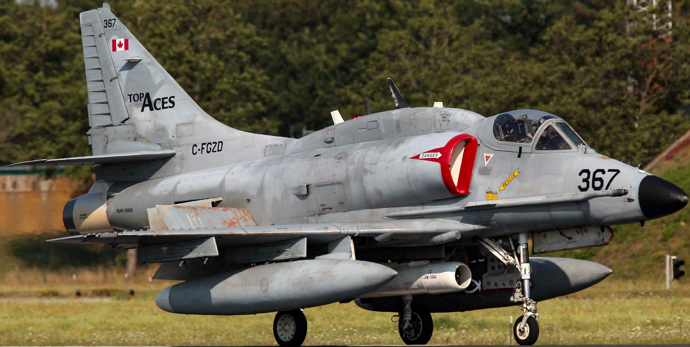
Top Aces A-4N Skyhawk with target tow pod installed under the uselage. This A-4N is an ex Israeli Defense Force Air Force 350.