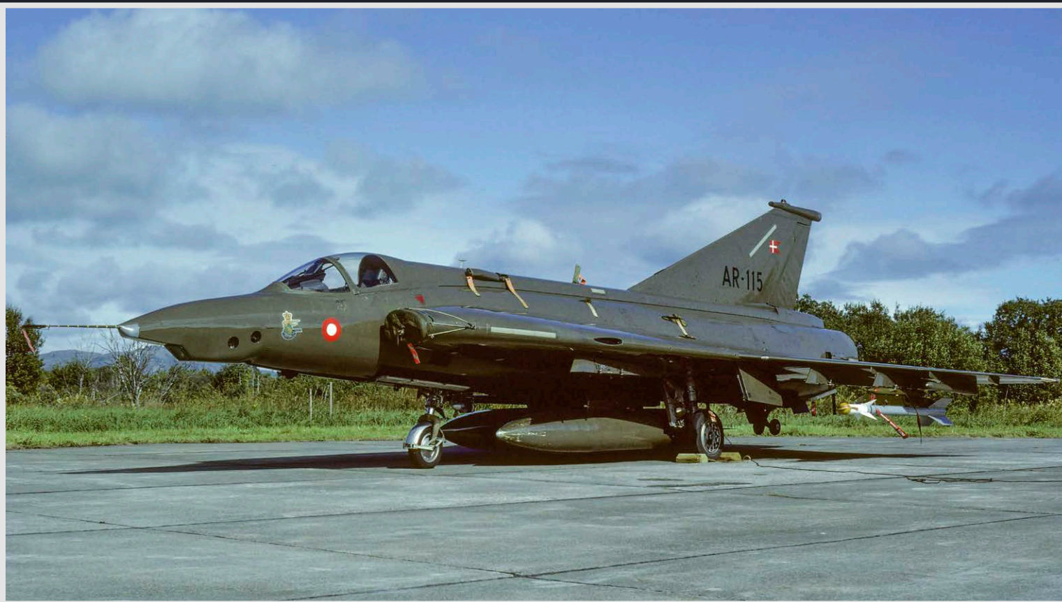
▲ The RDAF had 20 RF-35 Draken in reconnaissance configuration which were operated by Esk 729 at Karup AB. ▼ RF-35 Draken of Esk 729 during NATO exercise "TFM 87" at Öland AB/ Norway.