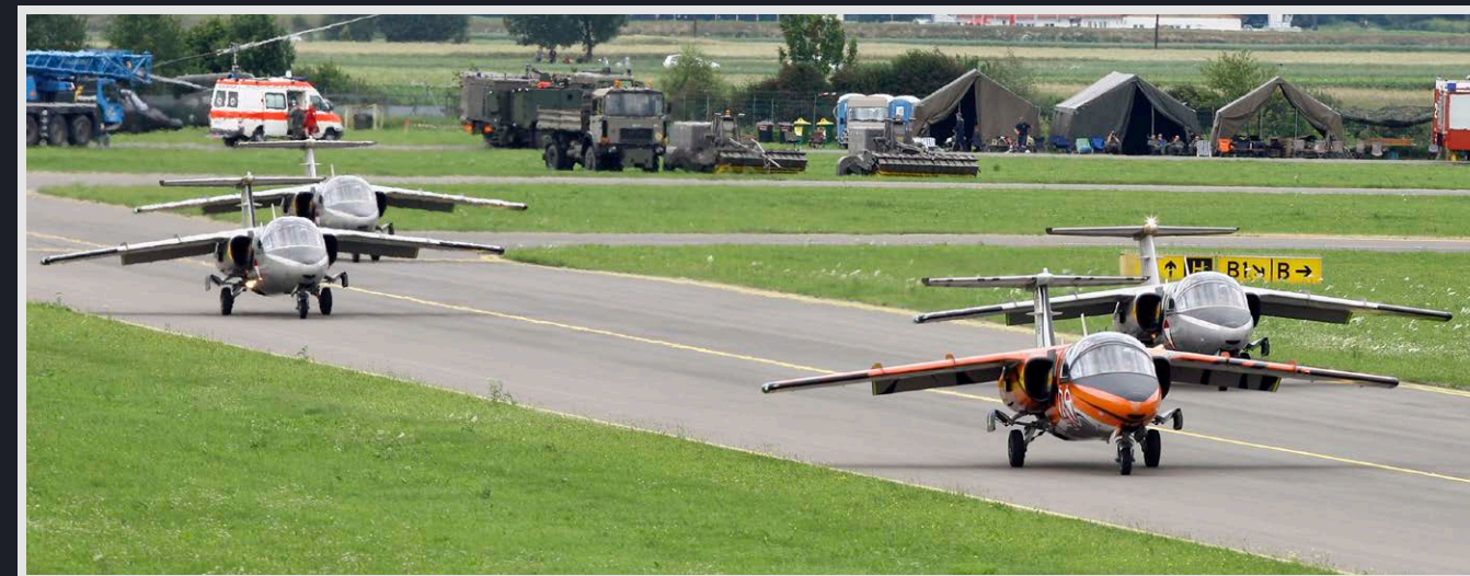
These Saab 105OE's are training at their home base Linz-Hörsching for an airshow. In 2010, one of the aircraft carries a "40 Years Saab 105" marking and was painted with a "tiger" color scheme, representing the Tiger Squadron.