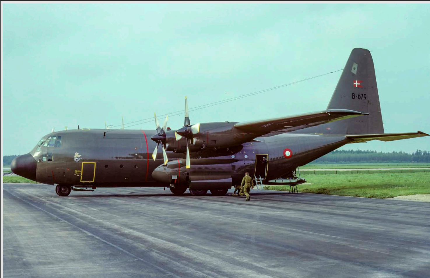
▲ One of a total of three C-130H belonged to the transport fleet of the Esk 721 from Værløse AB. This Hercules supported the NATO exercise "Best Focus 82" in Karup AB. ▼ The Douglas C-47A Skytrain was in RDAF service from 1953 to 1982 with Esk 721 at Værløse AB.