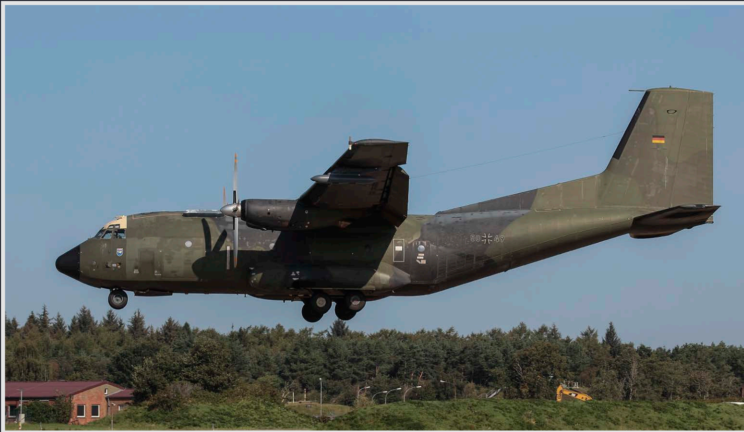
▲ German Air Force Transall C-160D assigned to LTG 63. ▼ Learjet 35A of GFD GmbH.