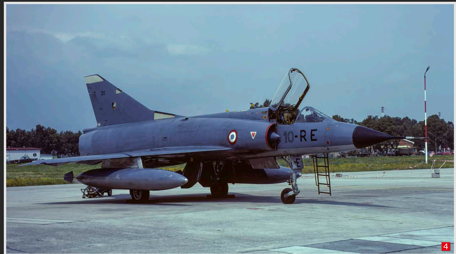
French Air Force Mirage IIIC assigned to EC 2/10 "Seine" at Creil AB, France with two external high speed fuel tanks and a Sidewinder sensor (1, 2, 3,) and with two large, standard fuel tanks (4).