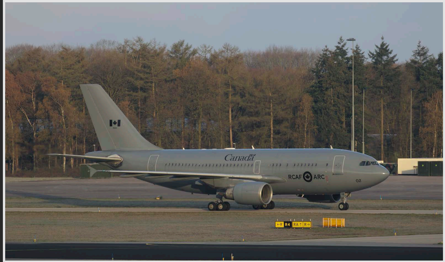
CC-150 Globemaster III of 437 Transport Squadron. ▲ CH-148 Cyclone of 423 Maritime Helicopter Squadron. ▼