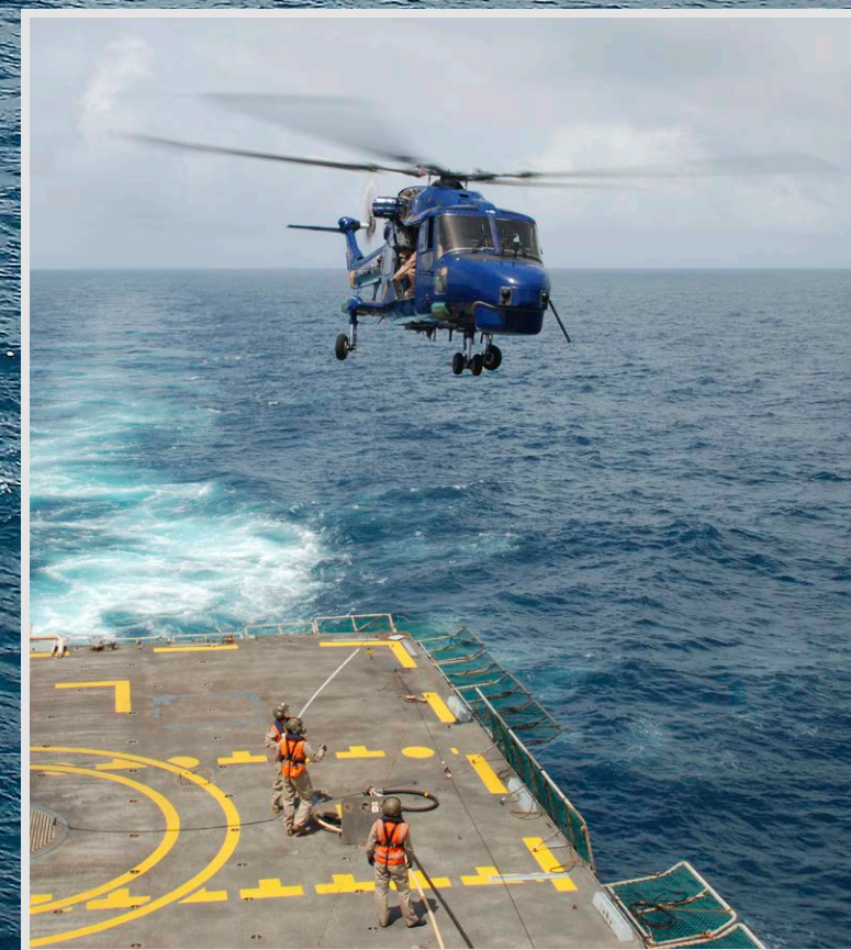
This Lynx Mk90B is inflight refueling from the support ship HDMS Esbern Snare (L17) in the Gulf of Aden during Operation Ocean Shield.