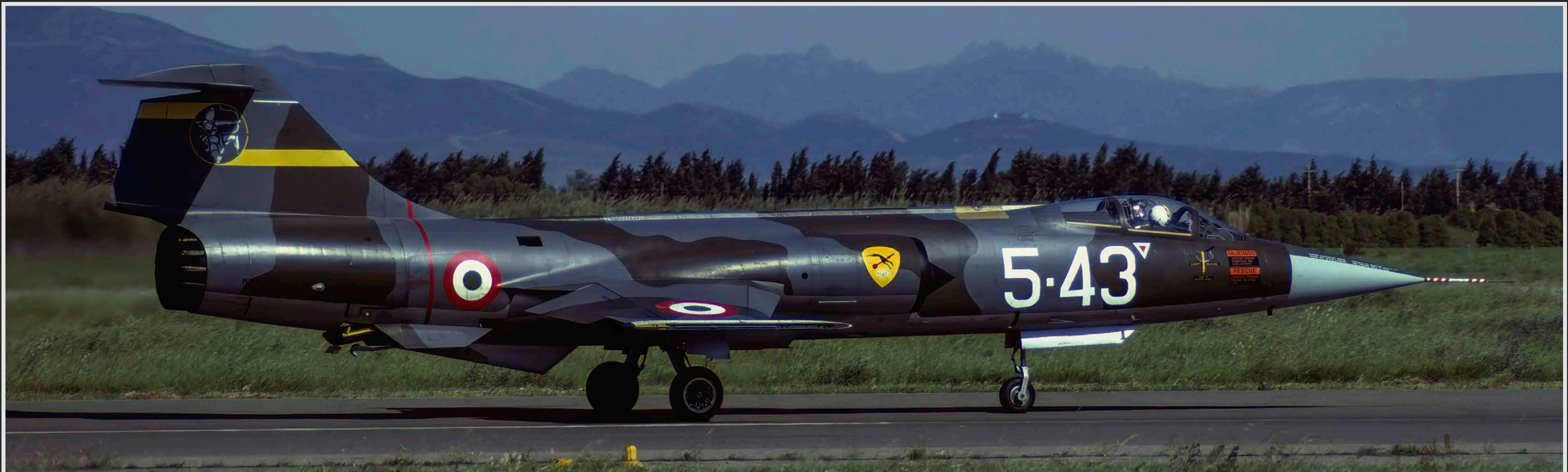
Italian Air Force Lockheed F-104S-ASA Starfighter assigned to 23° Gruppo/5° Stormo at Rimini AB, Italy without any external loads (clean configuration).