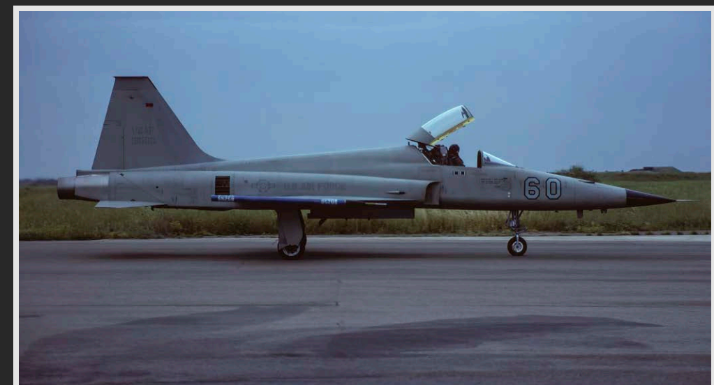
U.S. Air Force Northrop F-5E Tiger II assigned to 527th Tactical Fighter Training Aggressor Squadron at Alconbury AB, England.