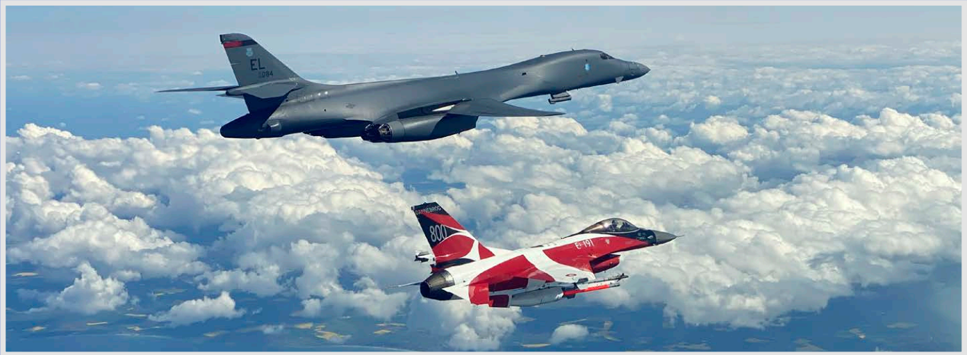
Above: The "Dannebrog" F-16 escorts an U.S. Air Force B-1B Lancer strategic bomber through Danish airspace.