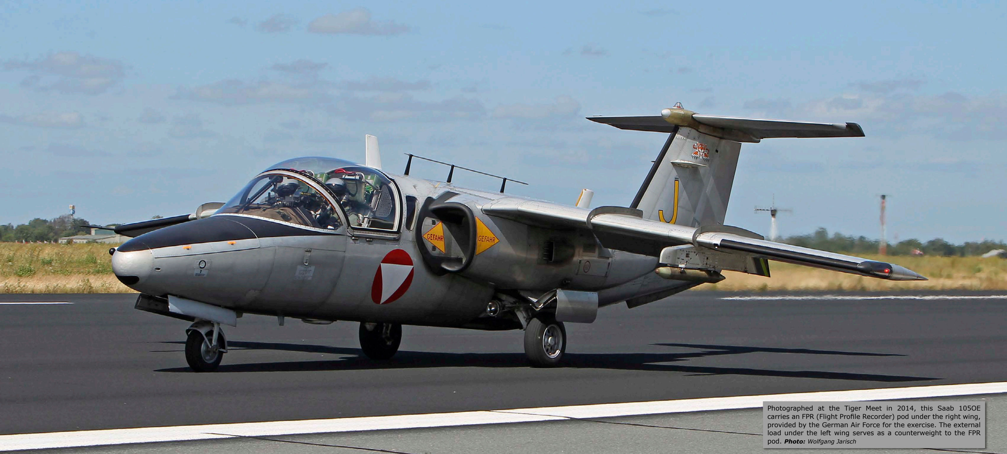
Photographed at the Tiger Meet in 2014, this Saab 105OE carries an FPR (Flight Profile Recorder) pod under the right wing, provided by the German Air Force for the exercise. The external load under the left wing serves as a counterweight to the FPR pod.

Saab originally planned to develop the Saab Sk60/105 as a business jet for up to five passengers. When the Swedish Air Force announced the need for a new jet trainer aircraft, Saab entered the race with a modified version of the business jet and, in December 1961, finally was awarded the contract to build a prototype. The first flight of the Saab Sk60/105 was on 29 June 1963. The Swedish Air Force received the first of its 150 Sk60 in 1966.