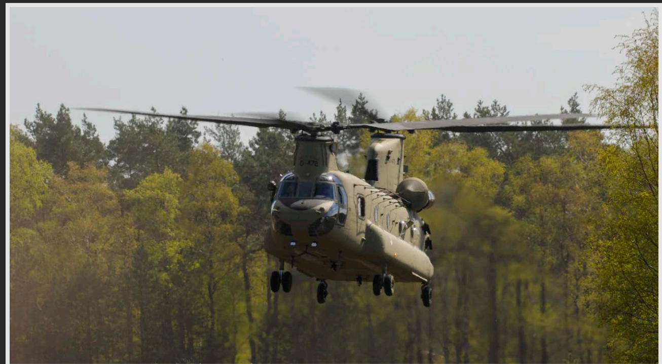
CH-47F MYII CAAS Chinook on its first low-level training mission in the low-flying area GLV 5 close to Eindhoven AB.