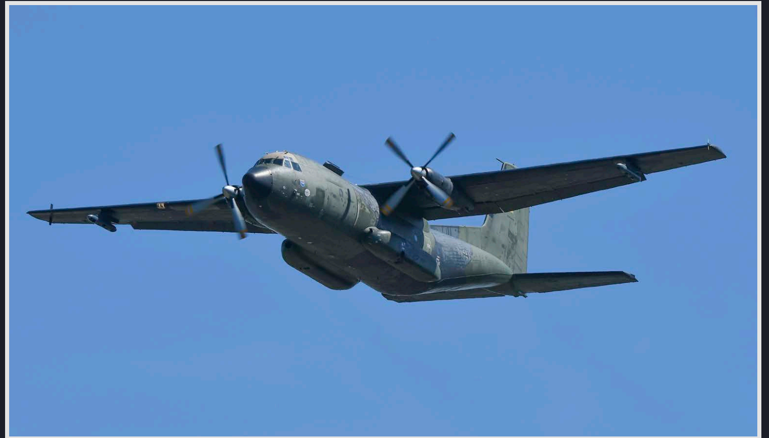
German Air Force Transall C-160D assigned to LTG 63. German Air Force Tornado IDS(T) assigned to TaktLwG 51 "I".