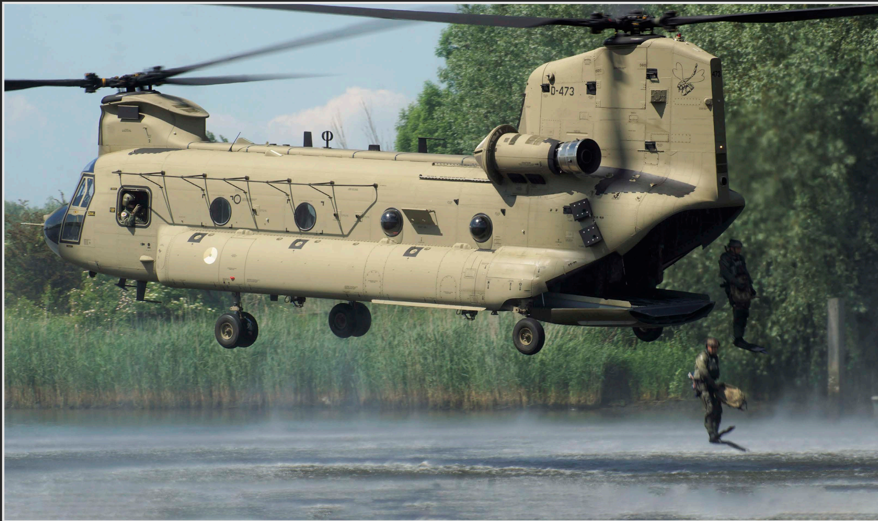
The Royal Netherlands Air Force's new CH-47F MYII CAAS was the first time used for helocast training on 7 June 2021.