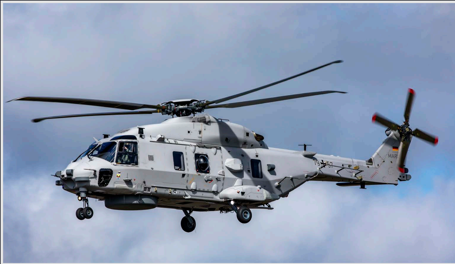
▲ German Navy NH90-NFH assigned to MFG 5. ▼ German Army NH90-TTH.