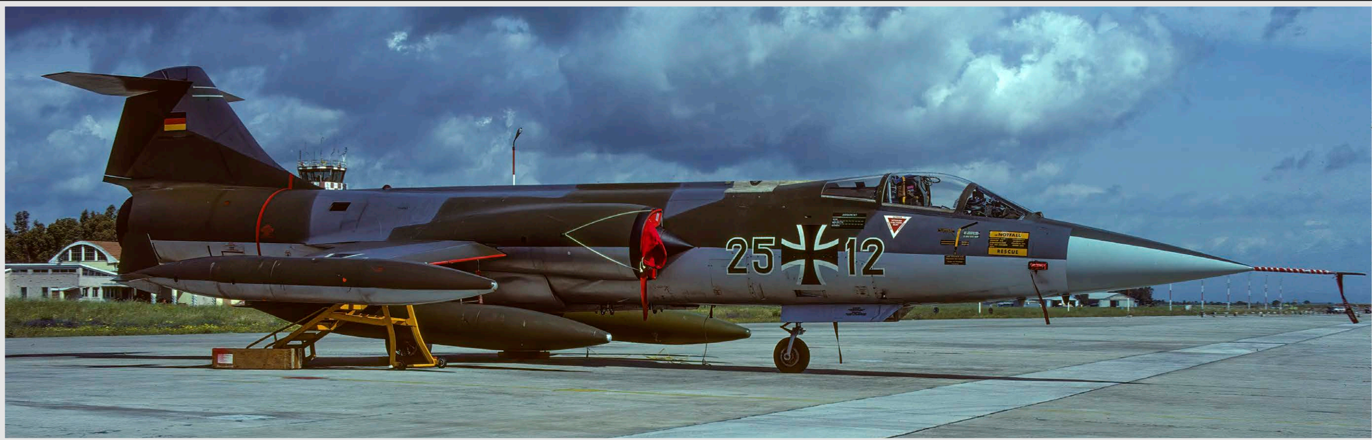
This German Air Force F-104G Starfighter made a stopover at Decimomannu on its ferry flight to the Turkish Air Force as part of NATO's assistance to the Turkish military. The F-104G is ex Jagdbombergeschwader 33.