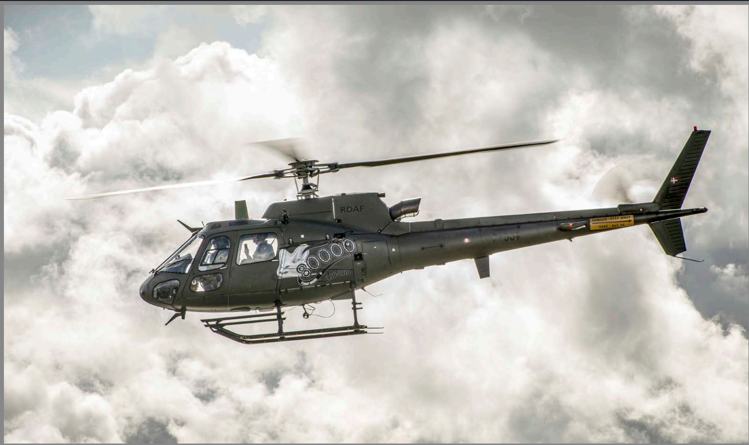
▲ AS550 C2 Fennec with special color scheme to celebrate 80.000 flight hours of the AS550 fleet. Photo: Royal Danish Air Force ▼ AS550 C2 combat demonstration at the Dragon Barracks in Holstebro in 2019. Photo: Royal Danish Air Force / Lars Mikkelsen