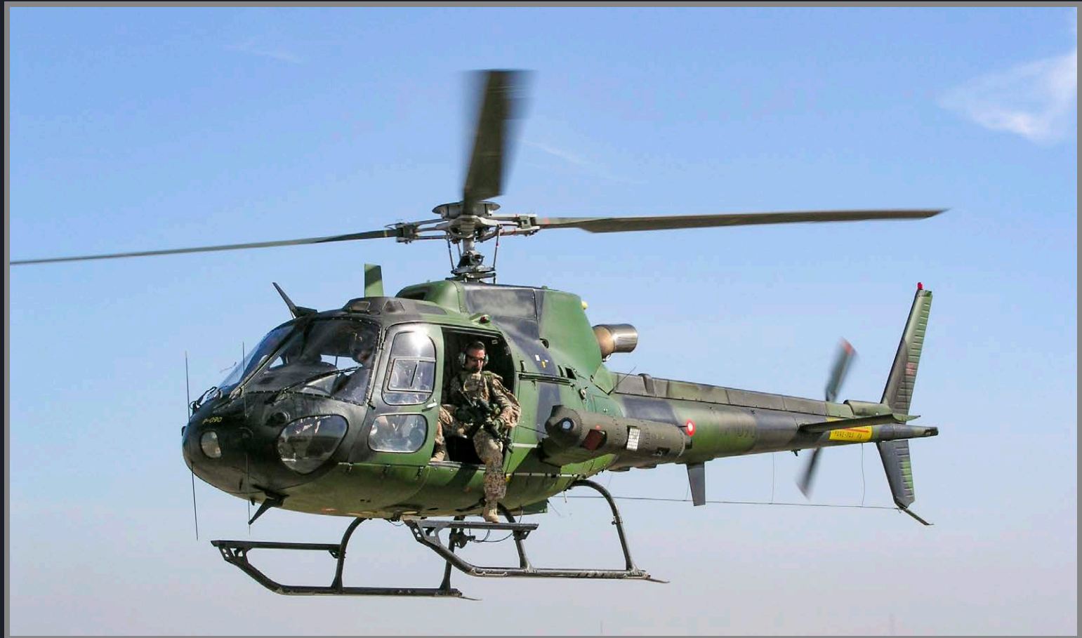
AS550 C2 Fennec in Iraq in 2008. Photo: Royal Danish Air Force AS550 C2 Fennec with sniper on board. Photo: Royal Danish Air Force / Lars Mikkelsen ▼