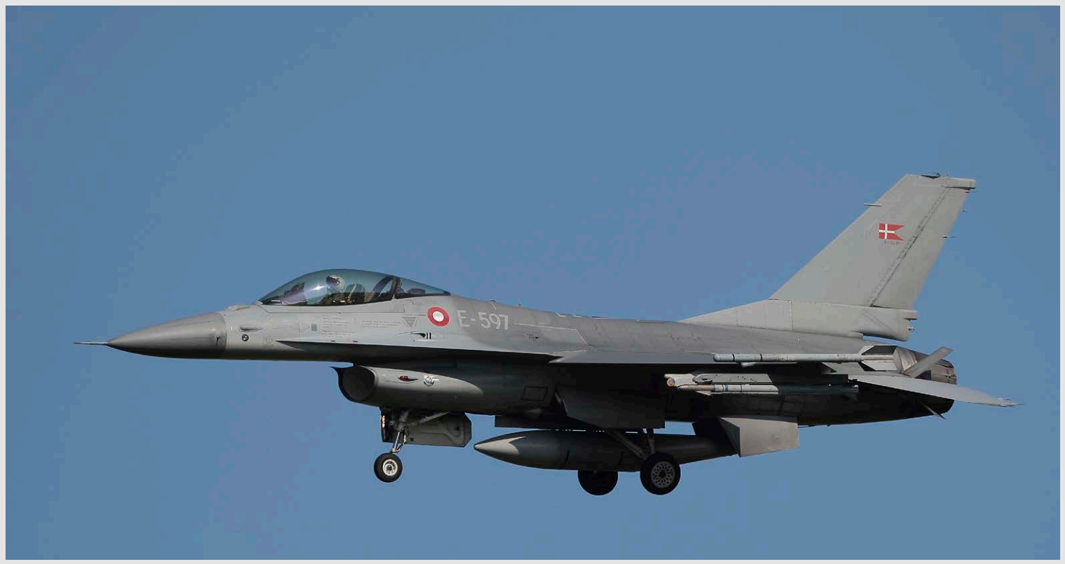
▲ F-16AM with a single center line fuel tank and four air-to-air missiles. ▼ Low pass of a clean F-16AM.