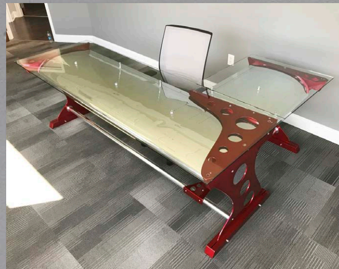
Beautifully hand-crafted furniture salvaged from aviation boneyards