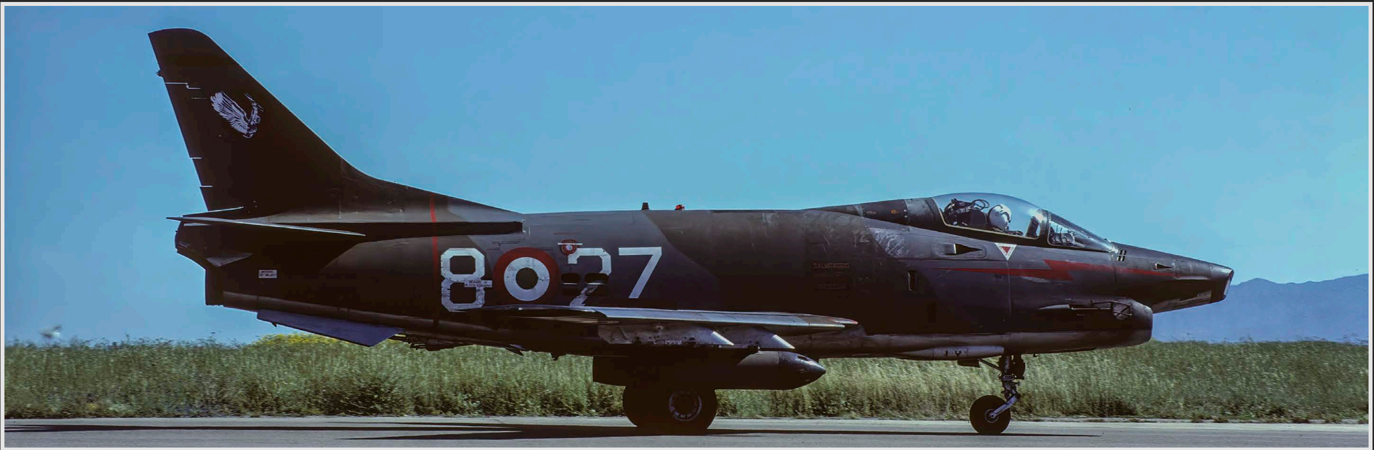
Italian Air Force Fiat G.91Y assigned to 101° Gruppo/8° Stormo at Cervia AB, Italy carrying a rocket launcher pod.