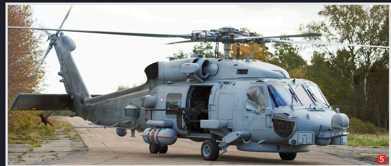
1 & 3: In June 2020, HDMS Niels Juel was in Greenland to operate under Arctic Command and contribute to sovereignty enforcement and surveillance of the waters. She conducted a helicopter exercise with an SH-60R from HDMS Hvidbjørnen.