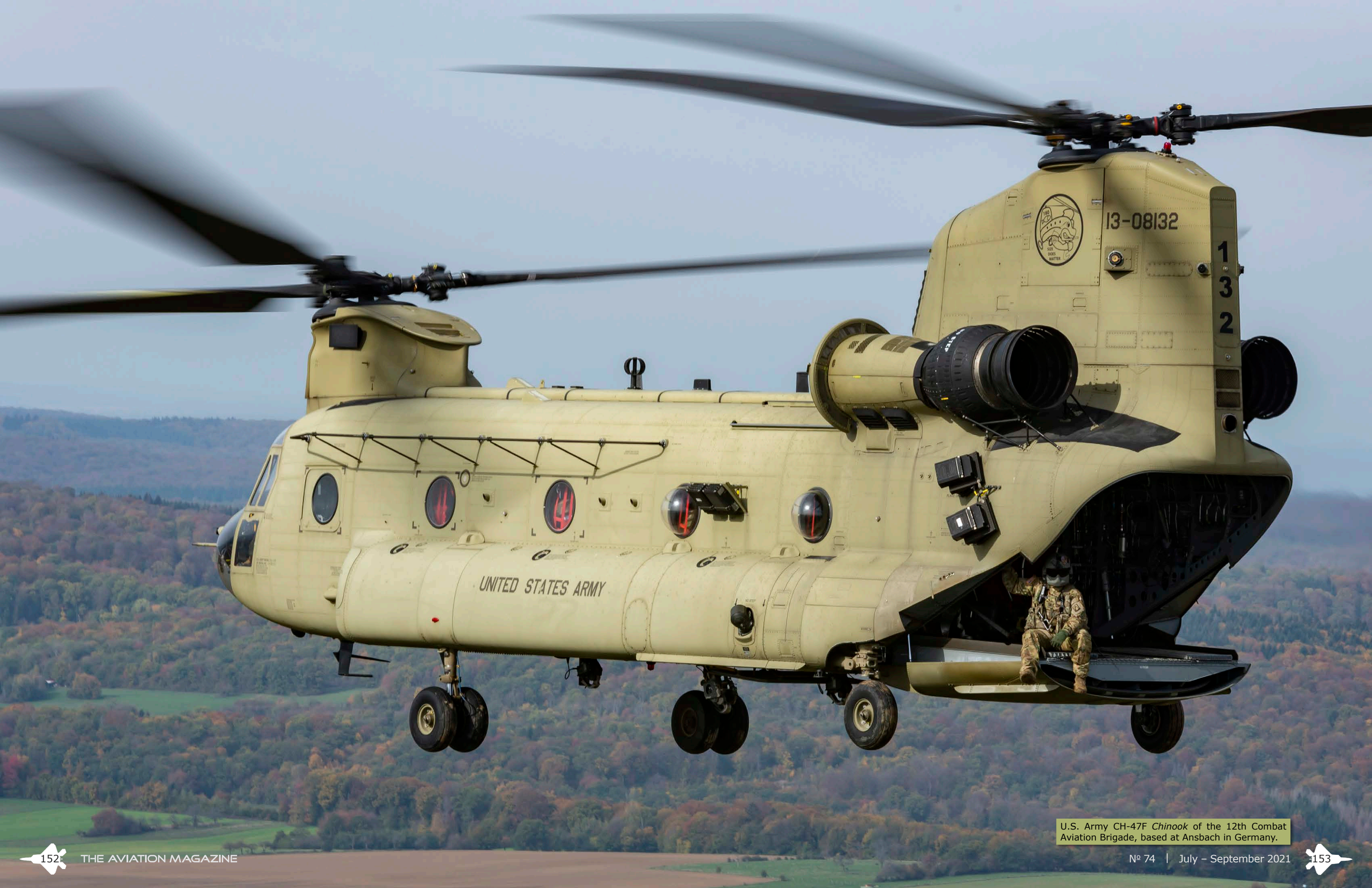
U.S. Army CH-47F Chinook of the 12th Combat Aviation Brigade, based at Ansbach in Germany.