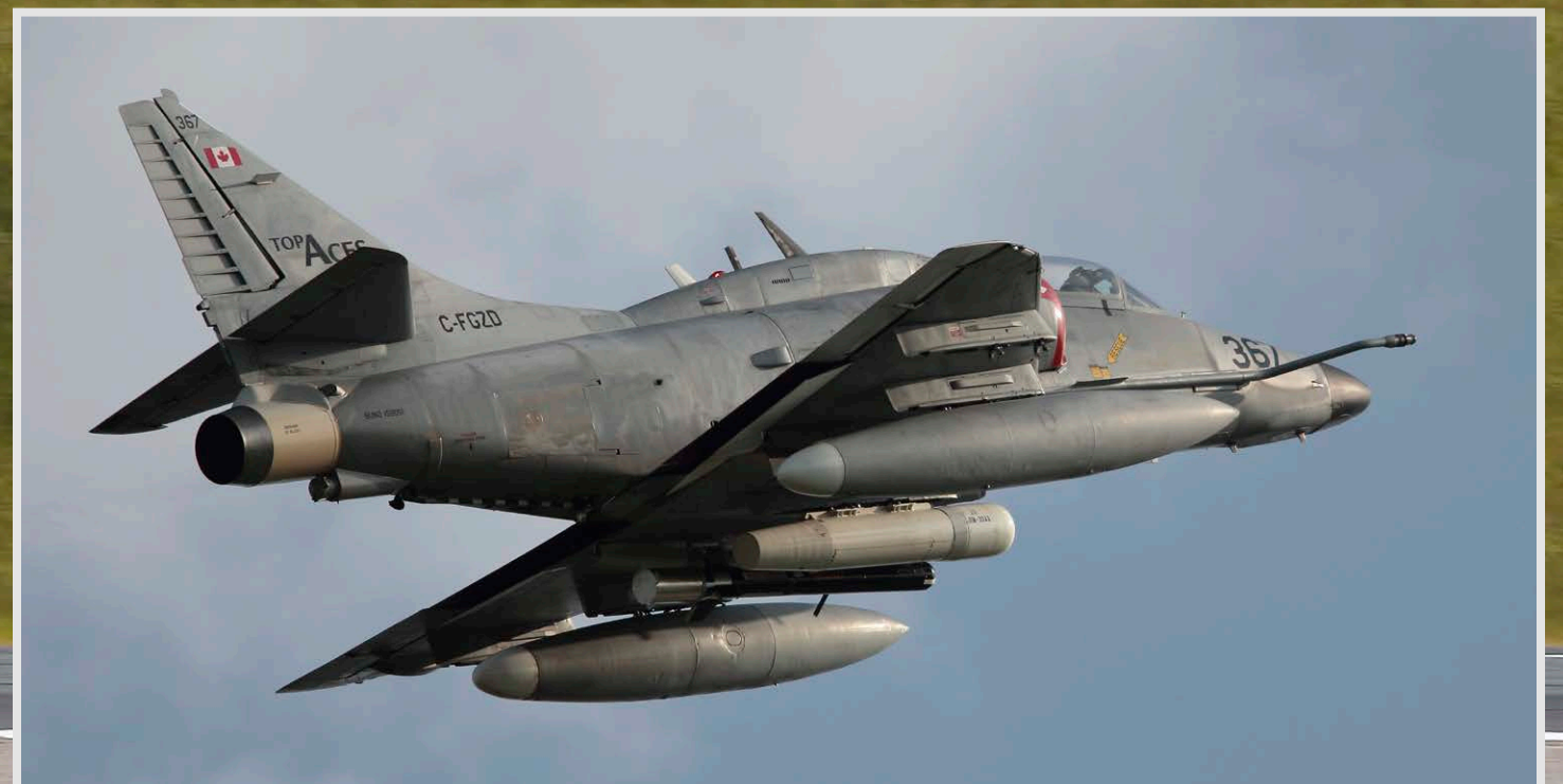
Top Aces A-4N Skyhawk