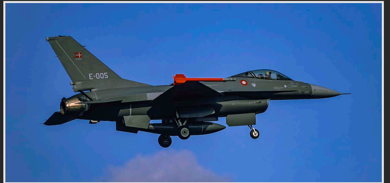
The F-16AM with serial E-005 is painted with the original F-35 paint and has an F-35-like color scheme.