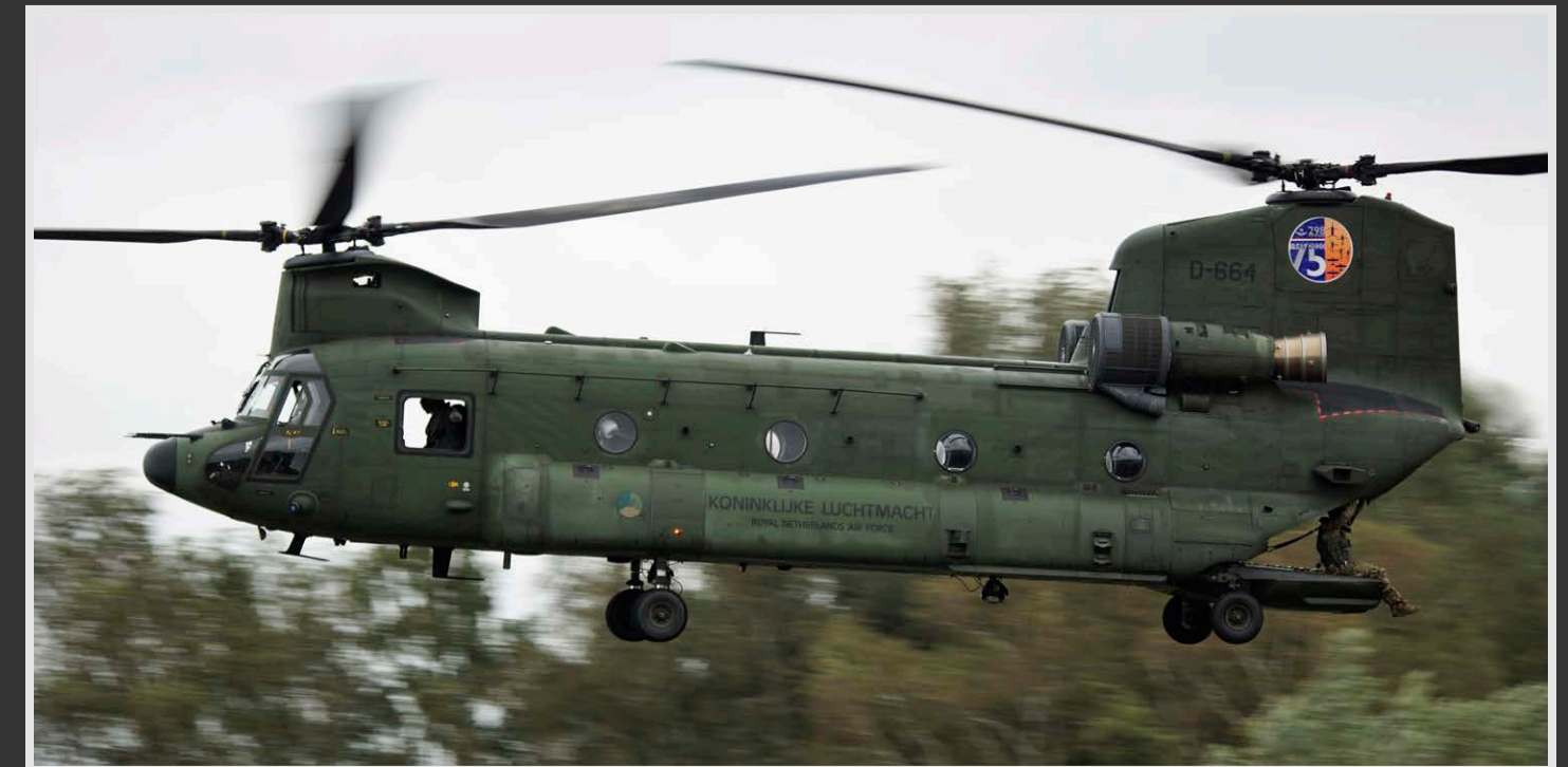
Top & above left: A CH-47D Chinook just dropped a RHIB (rigid hull inflatable boat). Top right: The Special Forces soldiers gather on the shore after jumping from the helicopter into the water. Above right: The CH-47D Chinook is leaving the drop zone.