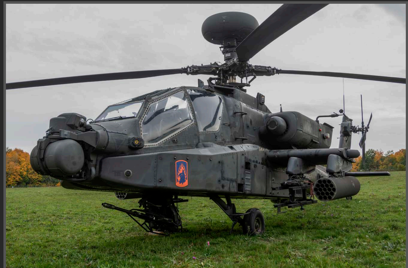
Top and above right: U.S. Army AH-64D Apache of the 12th Combat Aviation Brigade, based at Ansbach Airfield in Germany, and above left an UH-60M Blackhawk, based at Wiesbaden Airfield in Germany.