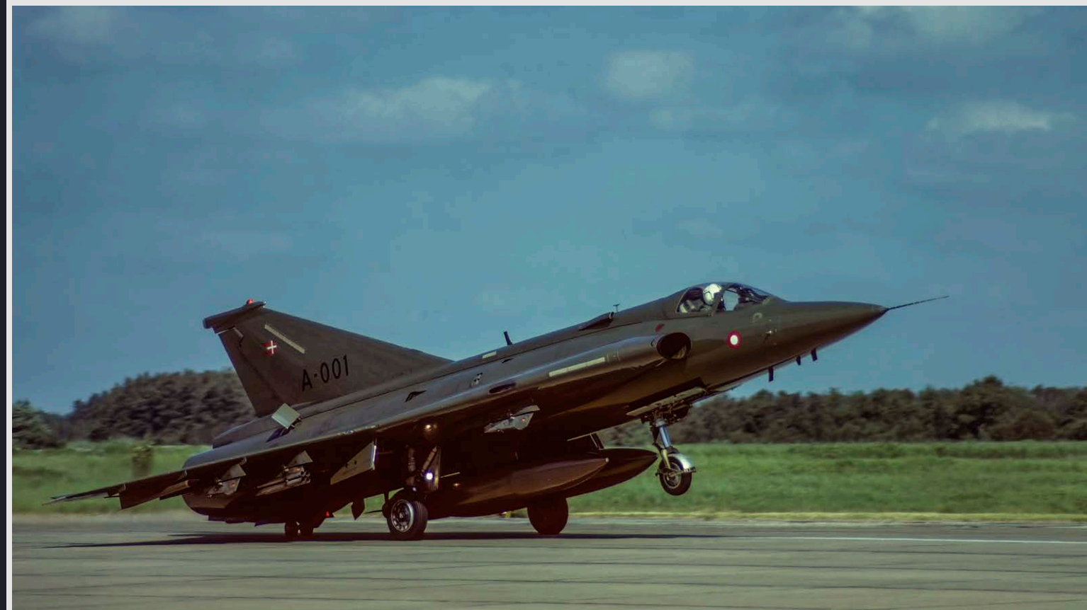
Esk 725 flew the fighter version of the F-35 Draken . This one is landing at Karup AB during the NATO exercise "Best Focus 82". ▲ The RDAF had a total of 11 TF-35 Draken training aircraft. This TF-35 was used as a "referee aircraft" during "Best Focus 82". ▼