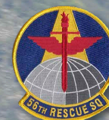
Main image: C-130J Super Hercules assigned to the 37th Airlift Squadron at Ramstein AFB, Germany. Insets: HH-60 Pave Hawk assigned to the 56th Rescue Squadron at Aviano AB, Italy.