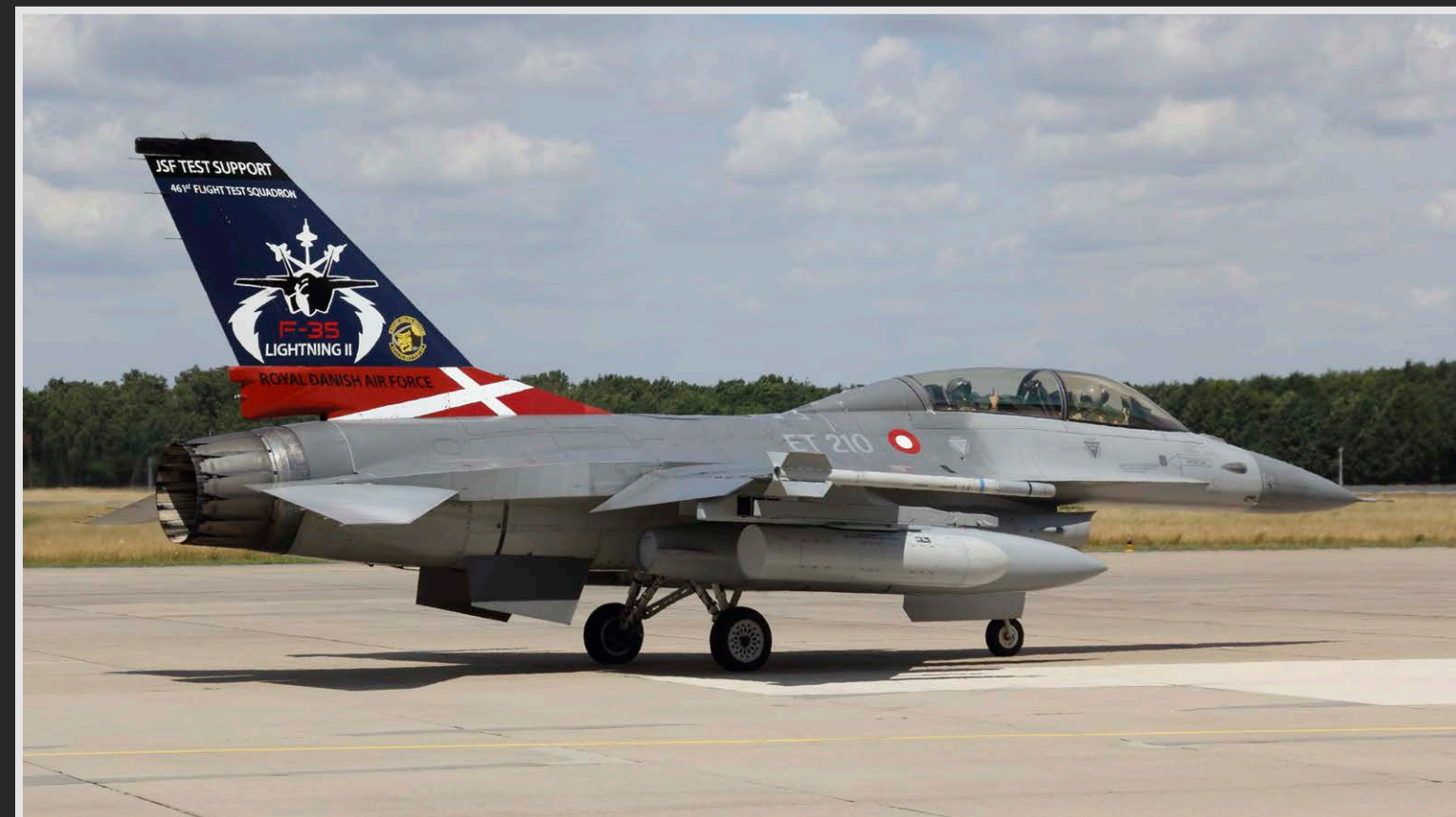
As part of the F-35 Lightning II Integrated Test Force, Denmark has contributed with an F-16BM Fighting Falcon , flying as a chase plane out of 461st FLTS Edwards Air Force Base, California from 2008-2016. During this period it has performed more than 1,100 missions in support of the F-35 flight tests. The F-16 was used as safety chase, photo chase and test support aircraft.