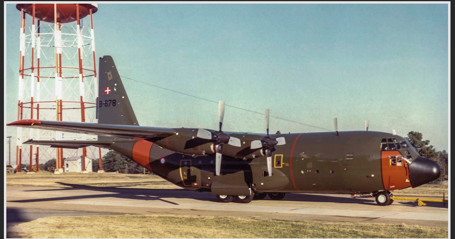
Lockheed C-130H Hercules assigned to Esk 721 at Værløse AB. Photo: Royal Danish Air Force ▲ The Douglas C-47A Skytrain is the military version of the DC-3. Photo: Royal Danish Air Force ▼