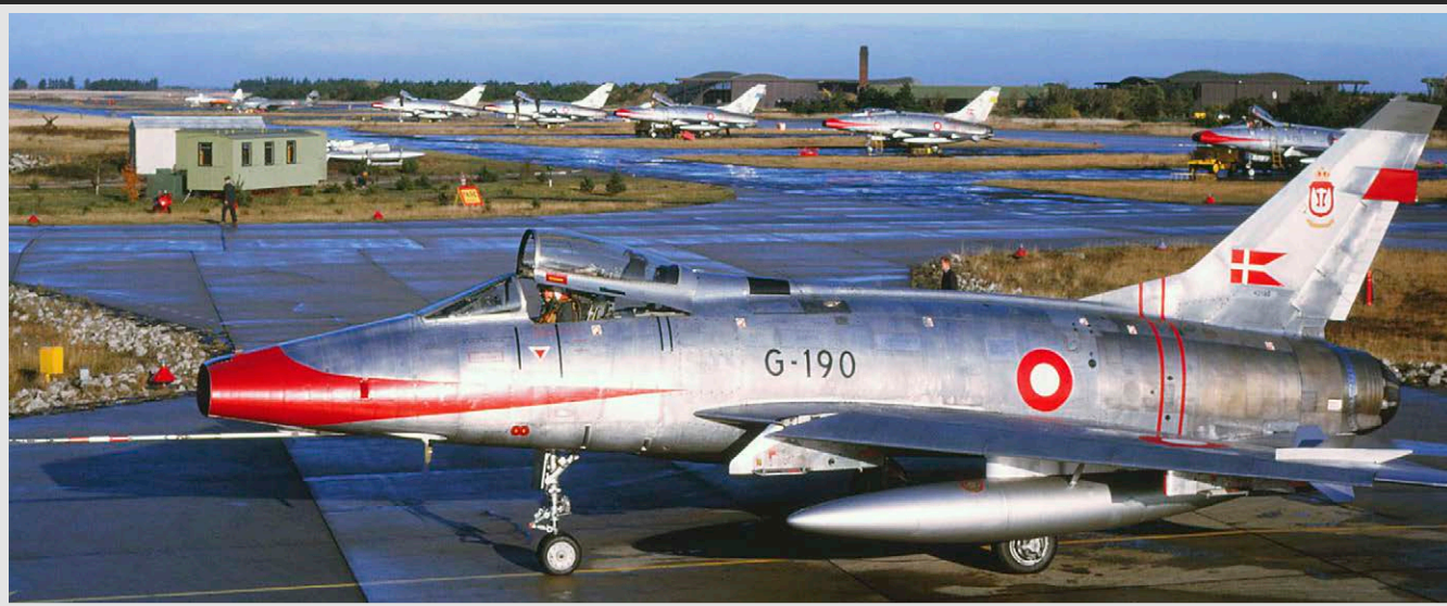
Super Sabre single-seater version North American F-100D (above) and two-seater F-100F (right) .