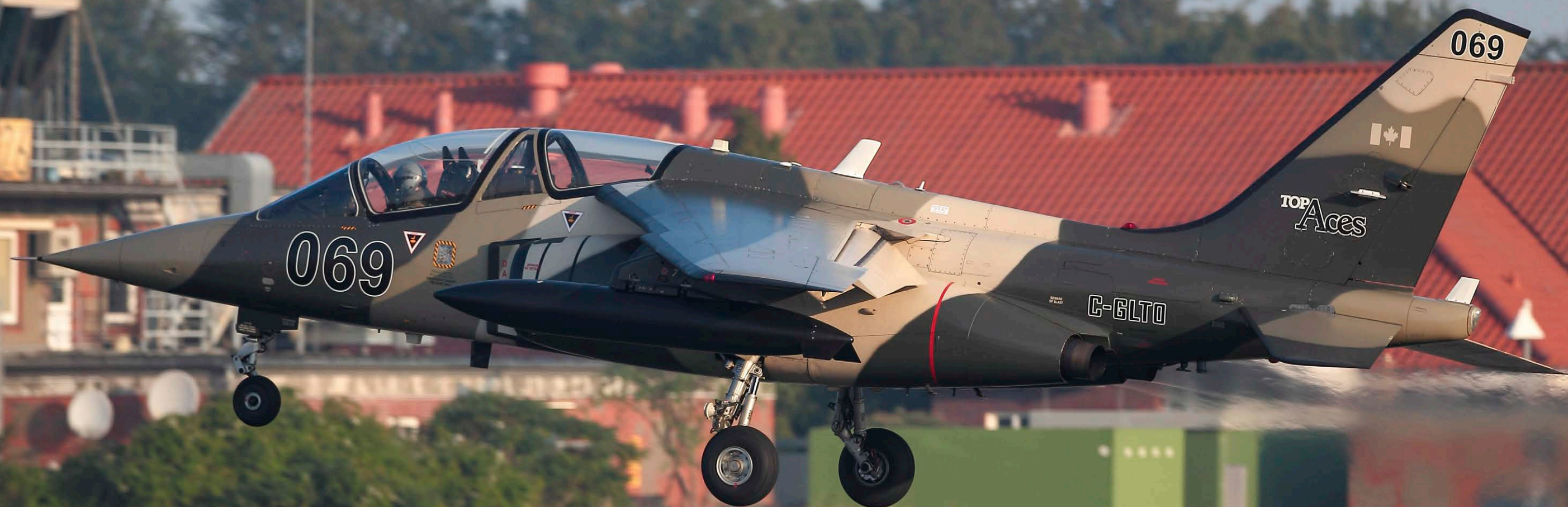
Top Aces Alpha Jet A, ex German Air Force 40+69, returning to Wittmund AB.