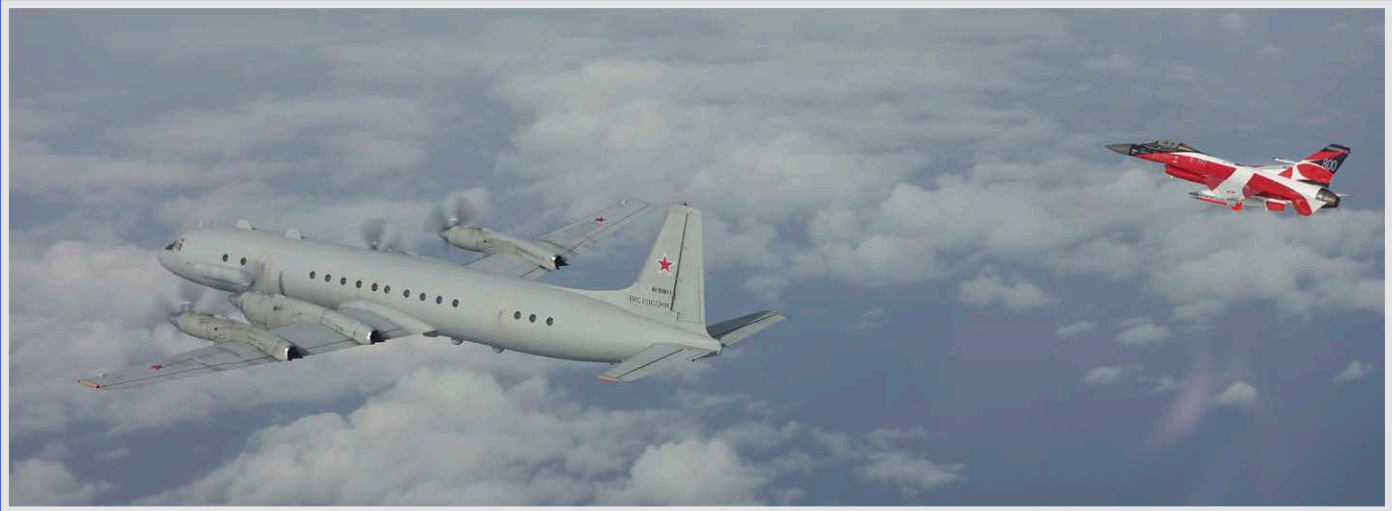
Above: The "Dannebrog" F-16 was scrambled to intercept a Russian Air Force IL-20M flying at the edge of Danish airspace. The aircraft, known in NATO as a COOT-A, did not enter Danish airspace.