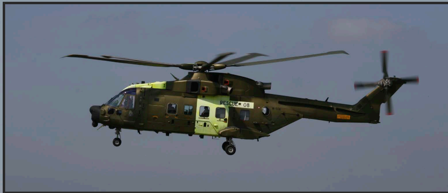
Some of the EH101 Merlins are configured for SAR (search and rescue) missions.