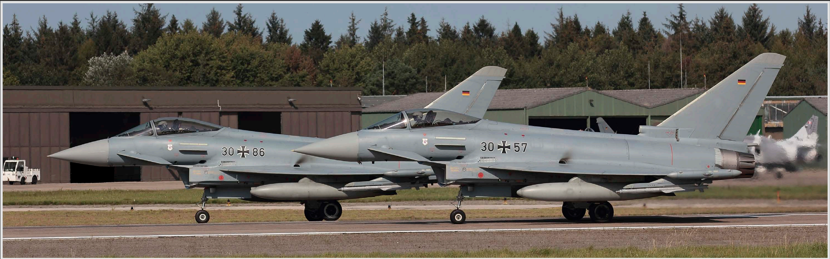
These two Eurofighters are sitting on the runway waiting for their takeoff clearance.