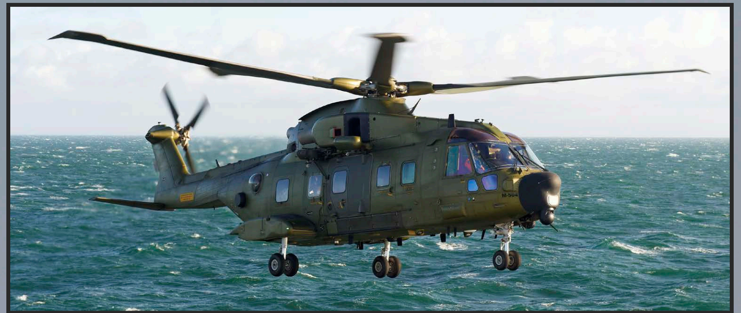
EH101 Merlin approaching the landing platform on HDMS Absalon (F341).