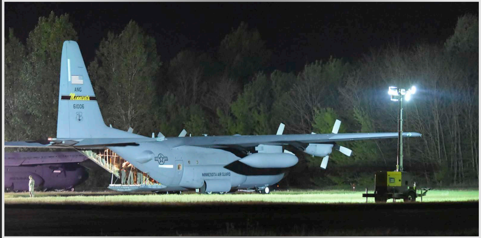
U.S. Air National Guard Lockheed C-130H Hercules assigned to 109th AS. Other than the C-17A, ▲ the C-130 is capable to deliver its cargo by dropping it in flight with the help of a parachute system. ▼