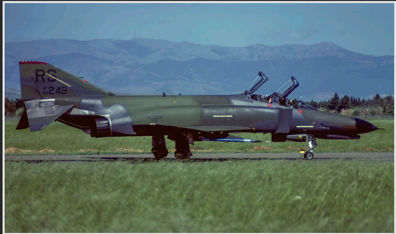
U.S. Air Force McDonnell Douglas F-4E Phantom II assigned to 86th Tactical Fighter Wing at Ramstein AB, Germany.