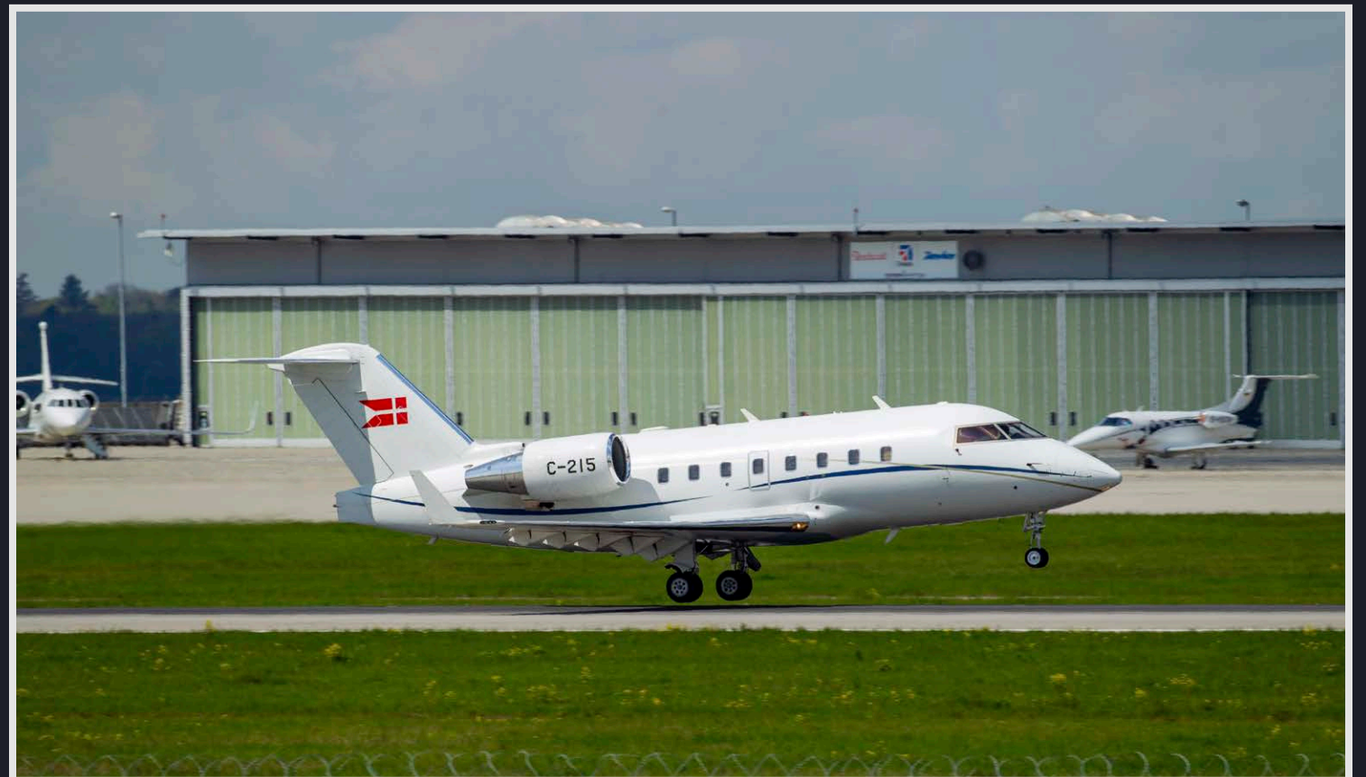
CL-604 takeoff at Stuttgart Airport, Germany. CL-604 over Greenland.