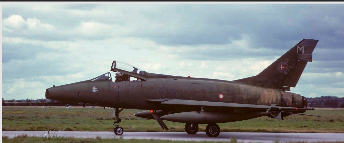
The RDAF operated a total of 72 Super Sabre F-100D (above & right) and F-100F (below) . Eskadrille 725, 727, 730 used this supersonic fighter from 1959-1982 at Karup AB before moving to Skrydstrup AB.