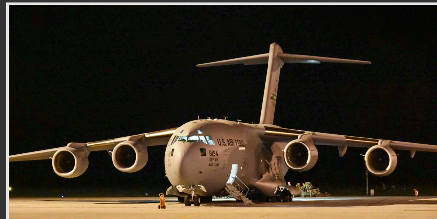
Top and right: U.S. Air Force Boeing C-17A Globemaster III assigned to the 62th Airlift Wing at McChord AFB. Above: Boeing C-17A Globemaster III assigned to the Strategic Airlift Capability (SAC) - a multinational initiative - and registered to Hungary.