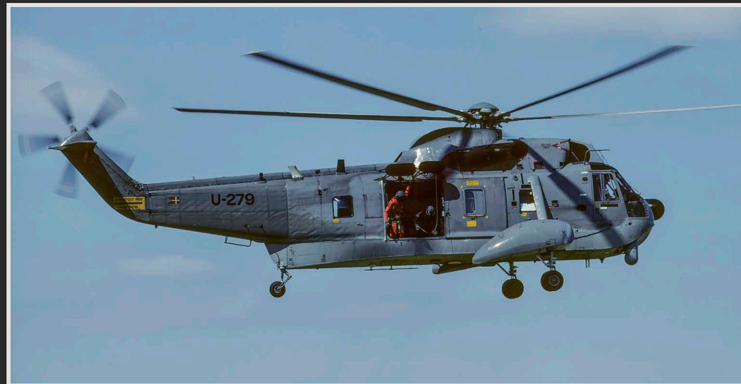
The Sikorsky Sea Kings S-61A-5 were used for SAR and operated by Esk 722 from the Vaerlose AB. ▲ Sikorsky Sea King S-61A-1 in the basic version taking off during the Open Dagen 1985 in Aalborg AB. ▼