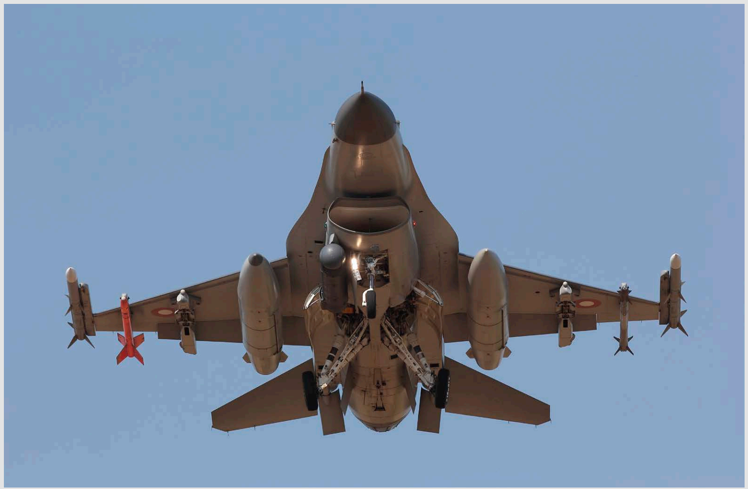
Heavily loaded F-16BM on final approach for landing at Skrydstrup AB. ▲▼