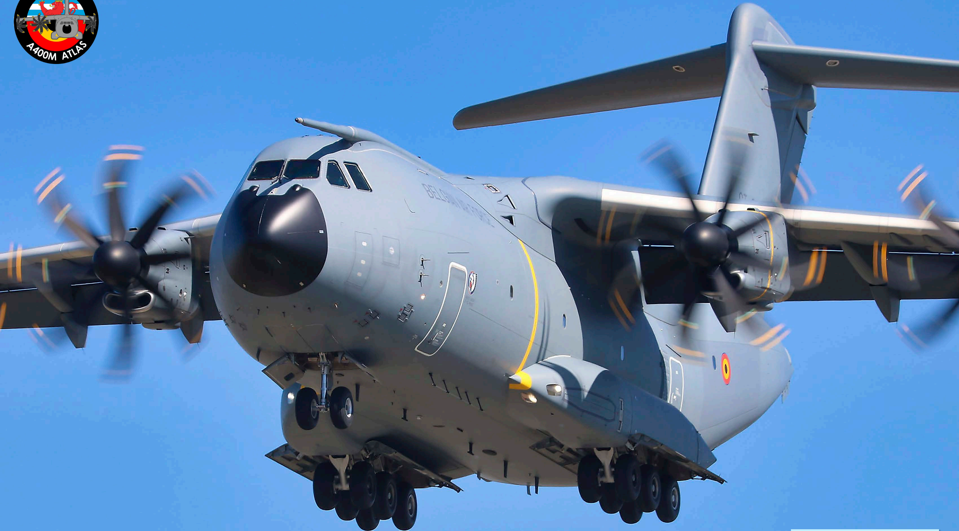
Belgian Air Force A400M Atlas seconds from touching down on the runway at Koksijde AB.