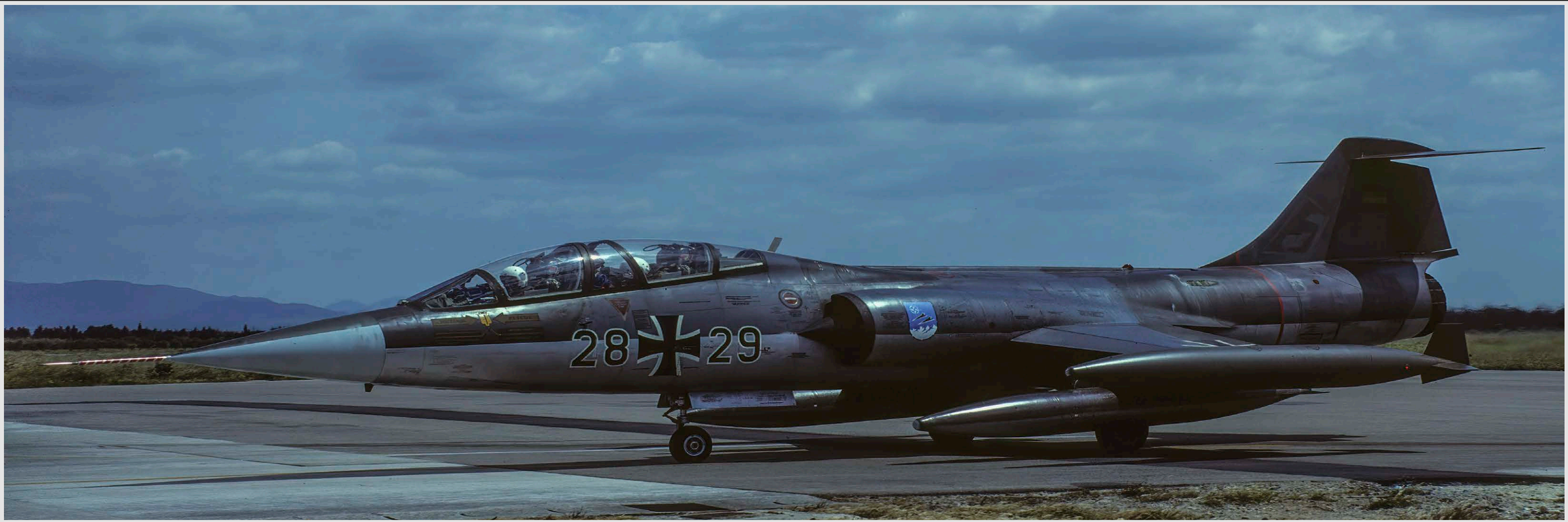
German Air Force Lockheed F-104G Starfighter ( below ) assigned to Jagdbombergeschwader 33 at Büchel AB, Germany.