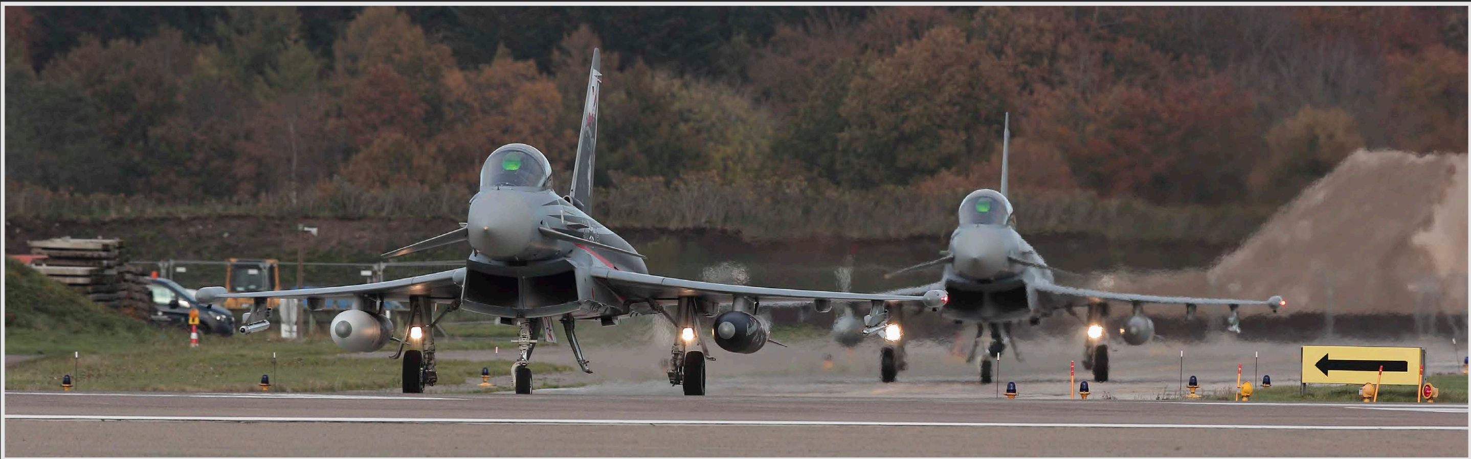
Two Eurofighter single-seaters just about to enter the runway.