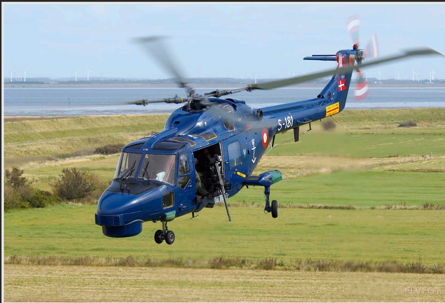
▲ Lynx Mk90B equipped with a 12.7mm TMG M3M FN Herstal machine gun over Rømø. Photo: Royal Danish Air Force ▼ Lynx Mk90B on board of HDMS Hvidbjørnen (F360) in the Prince Christian Sund. Photo: Royal Danish Air Force