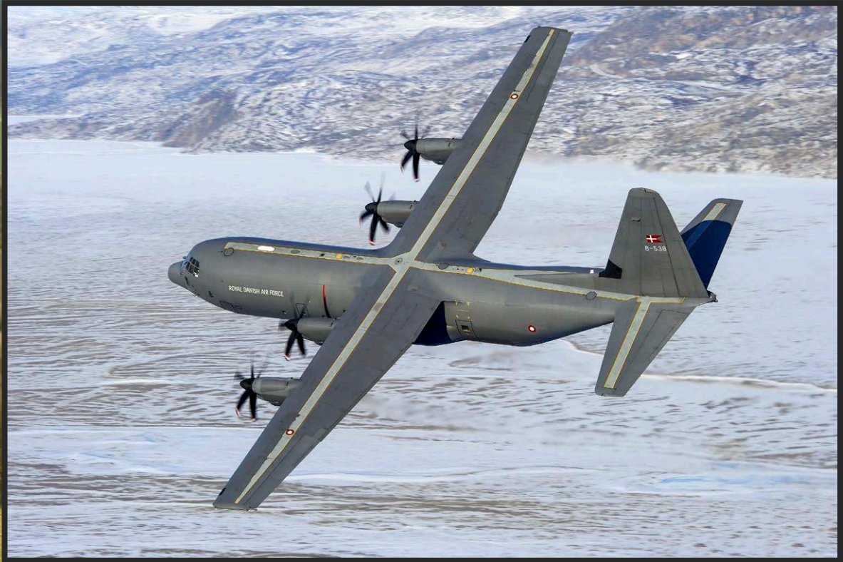
Main image: C-130J Hercules transport aircraft makes tactical drop over Denmark. Inset: C-130J Hercules over Greenland.