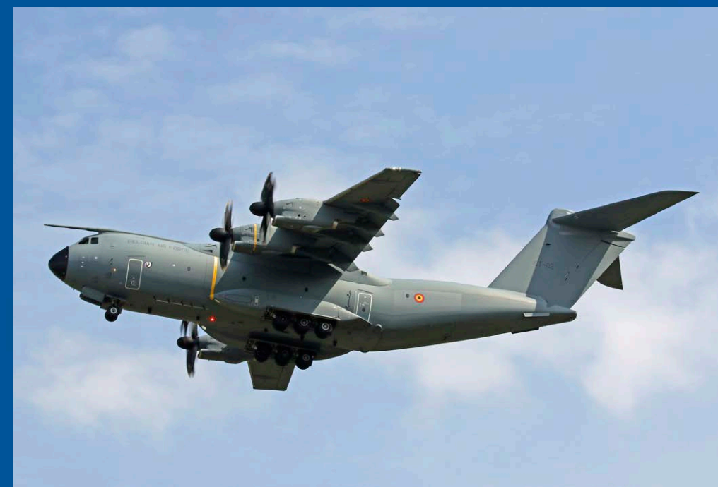
Main image: The Luxembourg A400M Atlas CT-01 pulls up into a steep left turn after a low high-speed pass. Inset top: CT-01 is returning to base. Inset bottom: The Belgium Air Force A400M Atlas CT-02 right after takeoff.