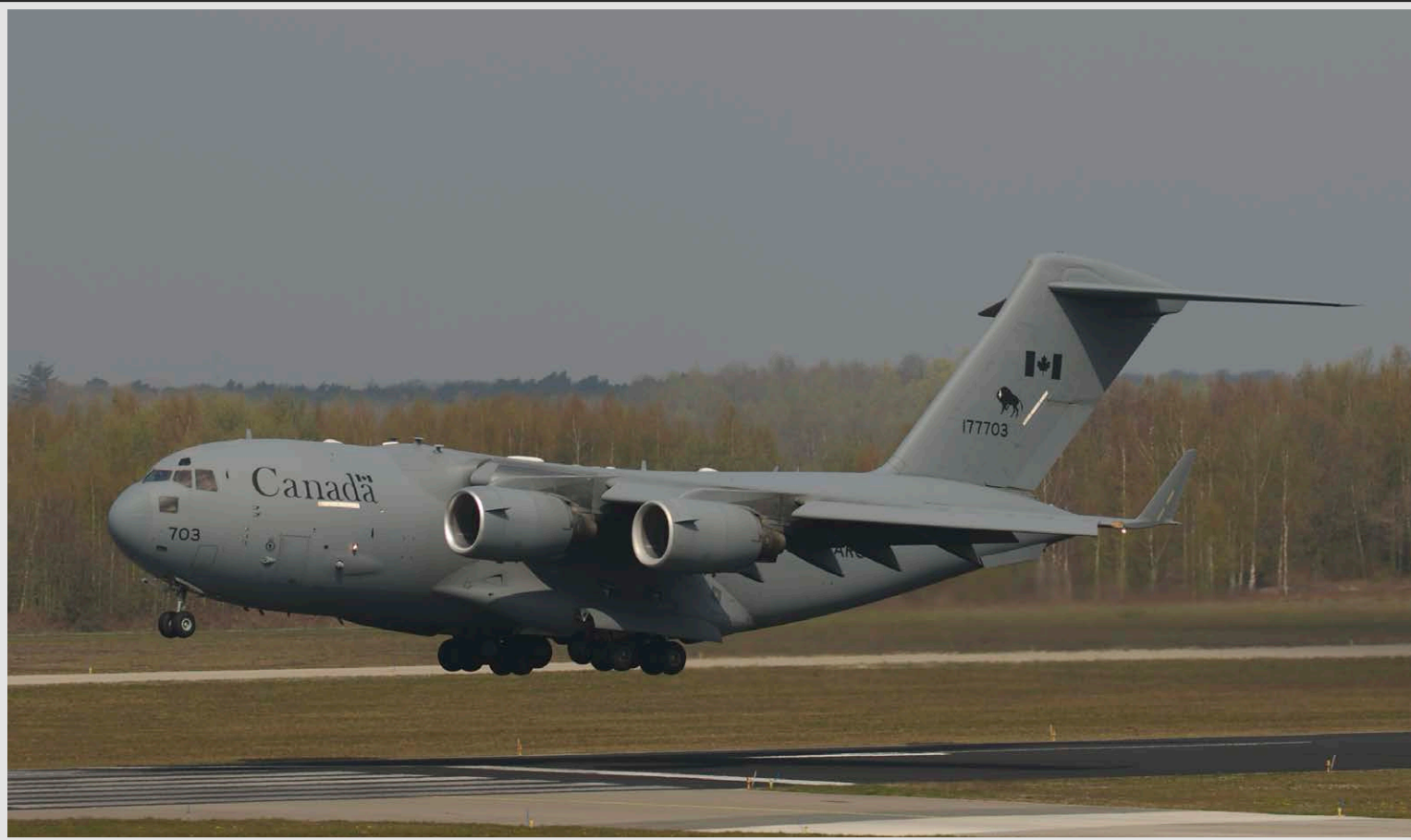
▲ CC-177 Globemaster III of 429 Transport Squadron. ▼ CH-148 Cyclone of 423 Maritime Helicopter Squadron.