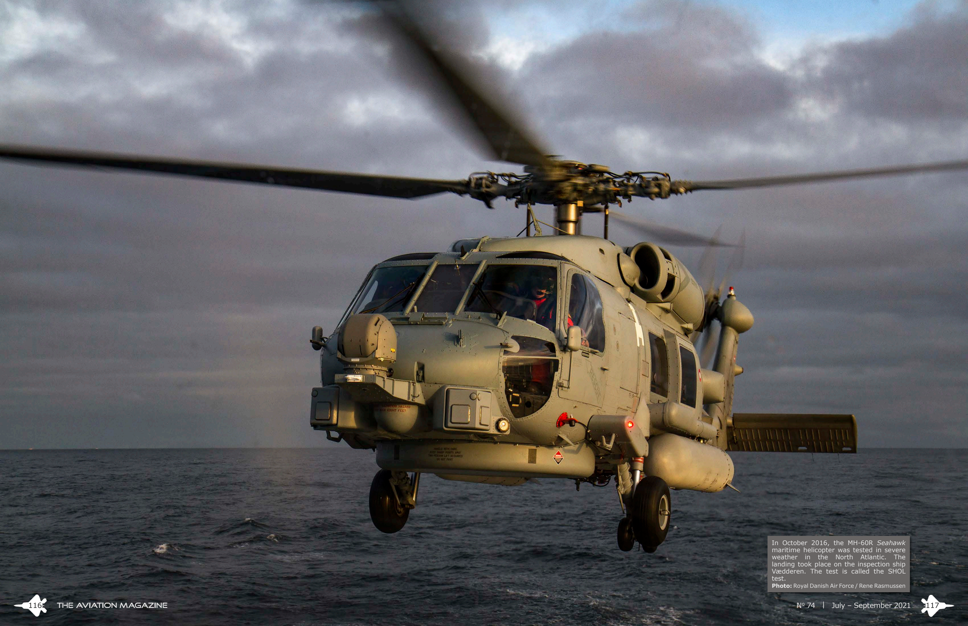
In October 2016, the MH-60R Seahawk maritime helicopter was tested in severe weather in the North Atlantic. The landing took place on the inspection ship Vædderen . The test is called the SHOL test.