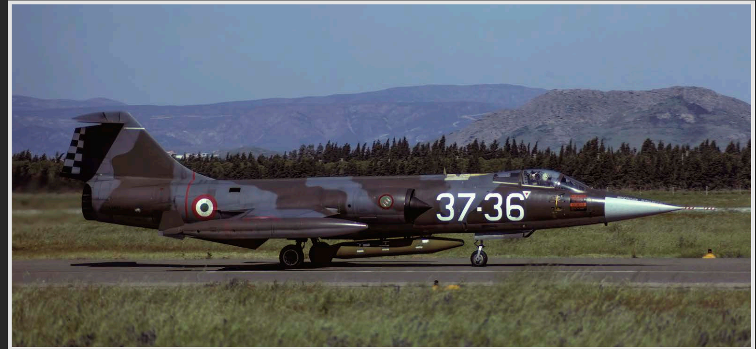
Italian Air Force Lockheed F-104S-ASA Starfighter assigned to 18° Gruppo/37° Stormo. Note the SUU-21 bomb dispenser for BDU48 and Mk75 bombs in addition to the fuel tip-tanks ( right ).