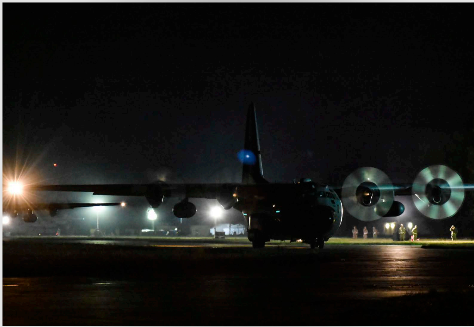
▲▼ Lockheed C-130J Hercules of the first wave on Monday night taxiing to the runway for take-off .