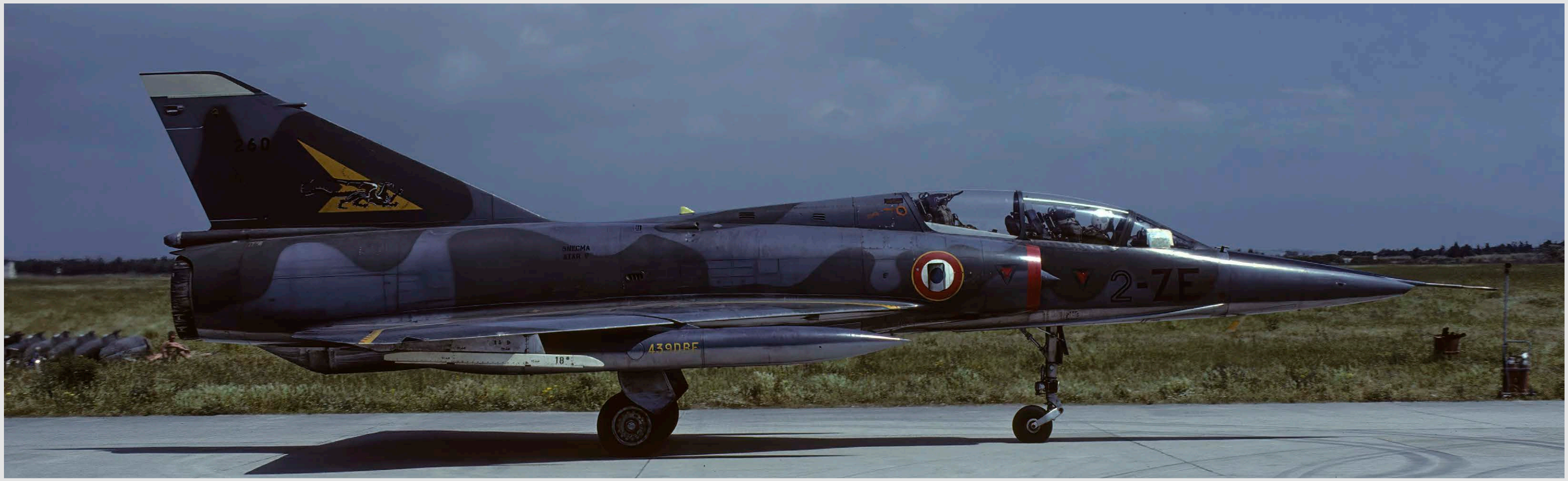
▲ French Air Force Mirage IIIBE assigned to ▼ ECR 2/2 "Côte d'Or" at Dijon AB, France.