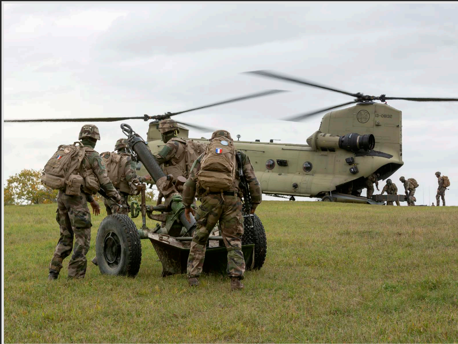
Other than the French NH90 Caiman , the CH-47 Chinook is able to transport a 120 mm mortar including 15 soldiers and protective elements. Just off-loaded from the Chinook , the mortar fires its first round.