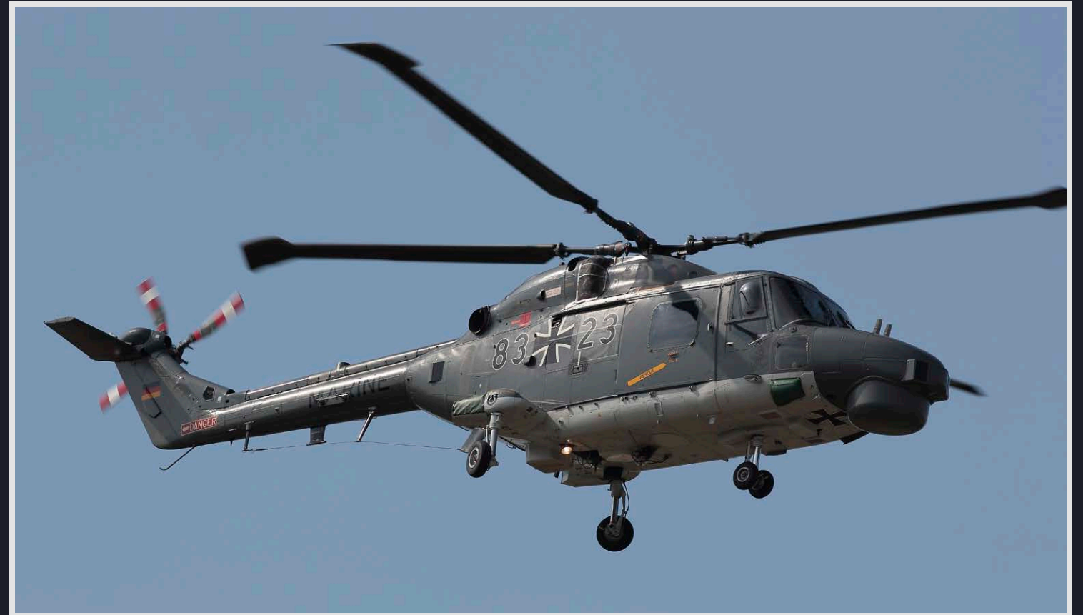
German Navy Super Lynx Mk88A assigned to MFG 5. ▲ German Army EC135T1 assigned to IntHubschrAusbZ. ▼