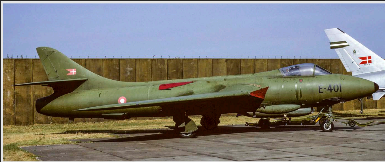
Thirty Hawker Hunter F. Mk.51 and two two-seater T. Mk.53 were initially used in Karup AB and ▲▼ finally in Aalborg AB with the Esk 724. They were in service until 1974.