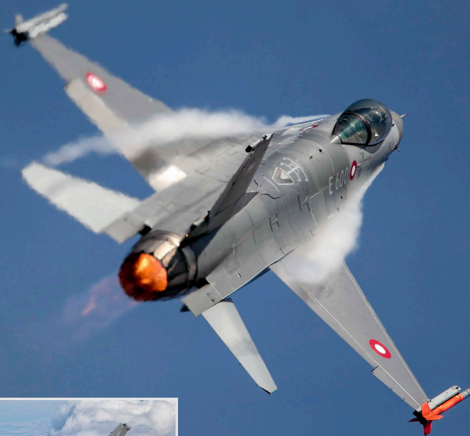
Insets: Danish F-16 Fighting Falcon during a NATO Baltic Air Policing deployment to Siauliai Air Base in Lithuania.