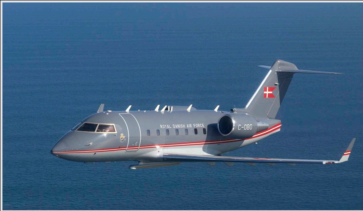
▲ CL-604 on a marine environmental flight on oil pollution. ▼ CL-604 at the Royal International Air Tattoo 2007.