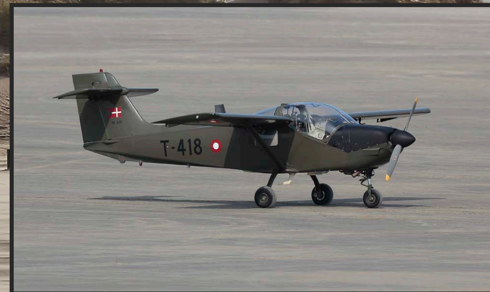
Main image: C-130J Hercules during beach landing exercise at Rømø, Denmark. Insets: T-17 Supporter on the beach.