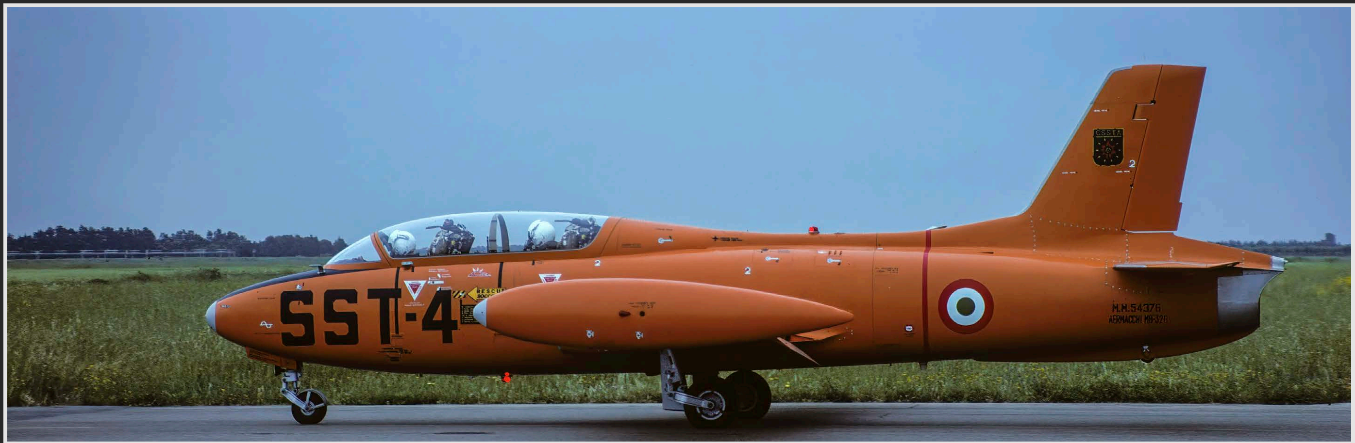
Italian Air Force Aermacchi MB326E assigned to CSSTA (Centro Sperimentazione E Standardizzazione Tiro Aereo) Decimomannu, Italy.